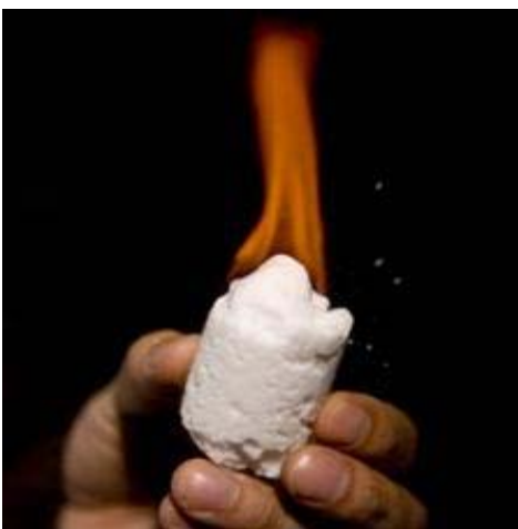
Figure 1 – Burning gas hydrate.

Complex issues would need to be addressed if gas hydrate were